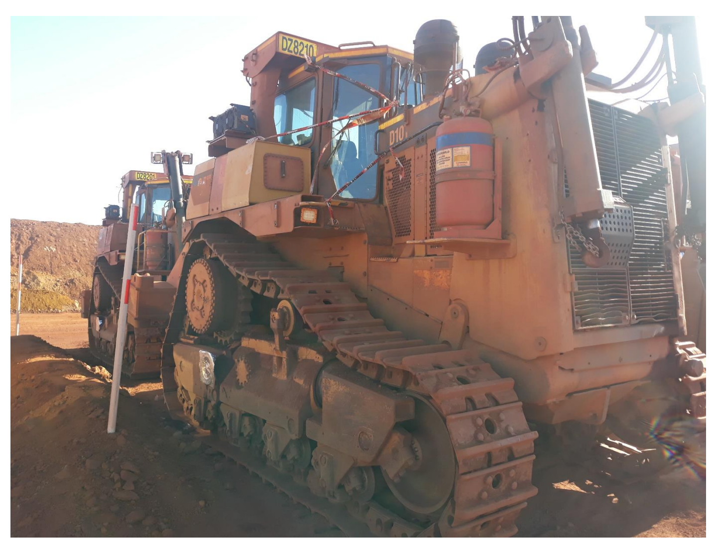
LH Side Front View