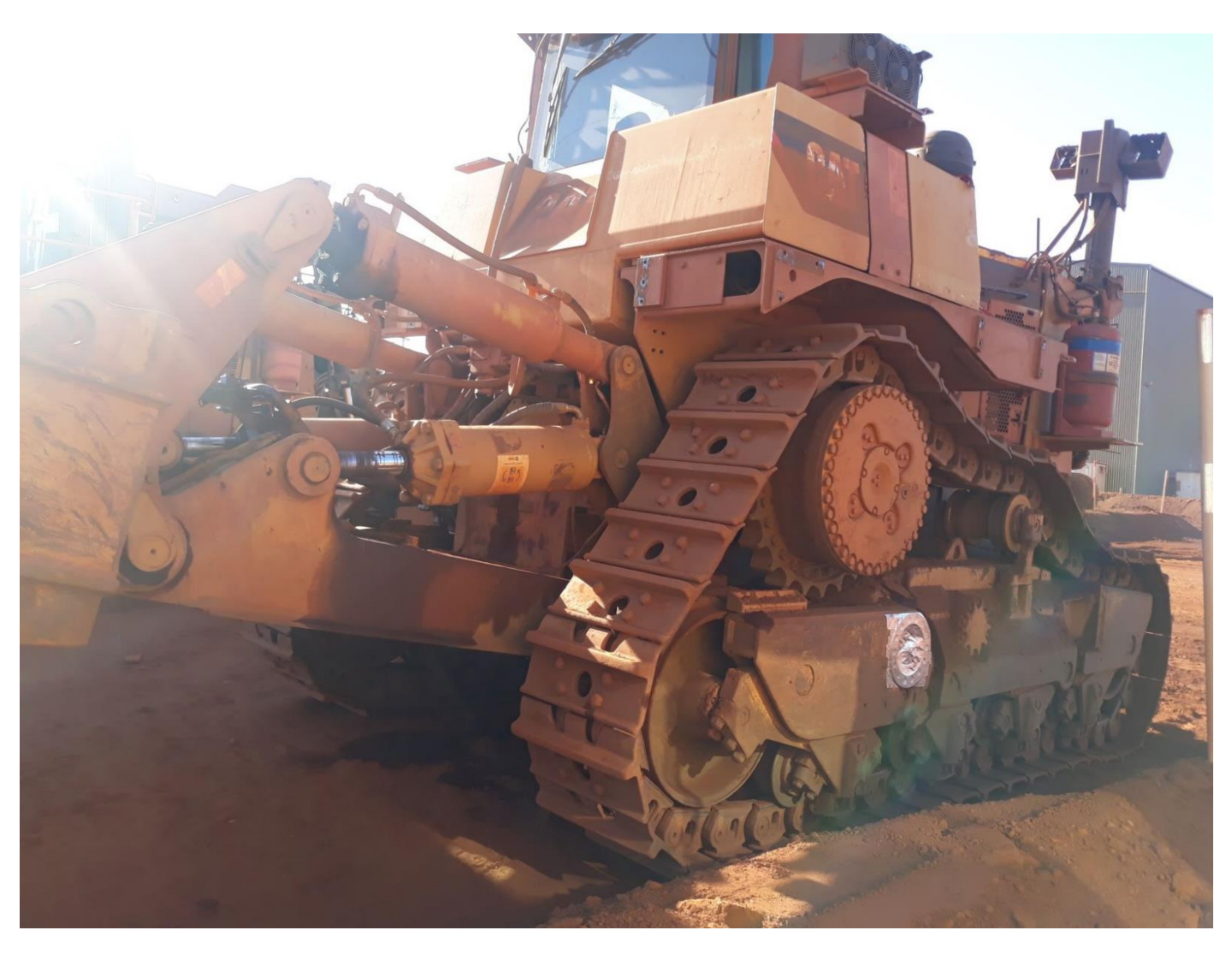
Rear View – Tilt and Lift Cyl seals weeping