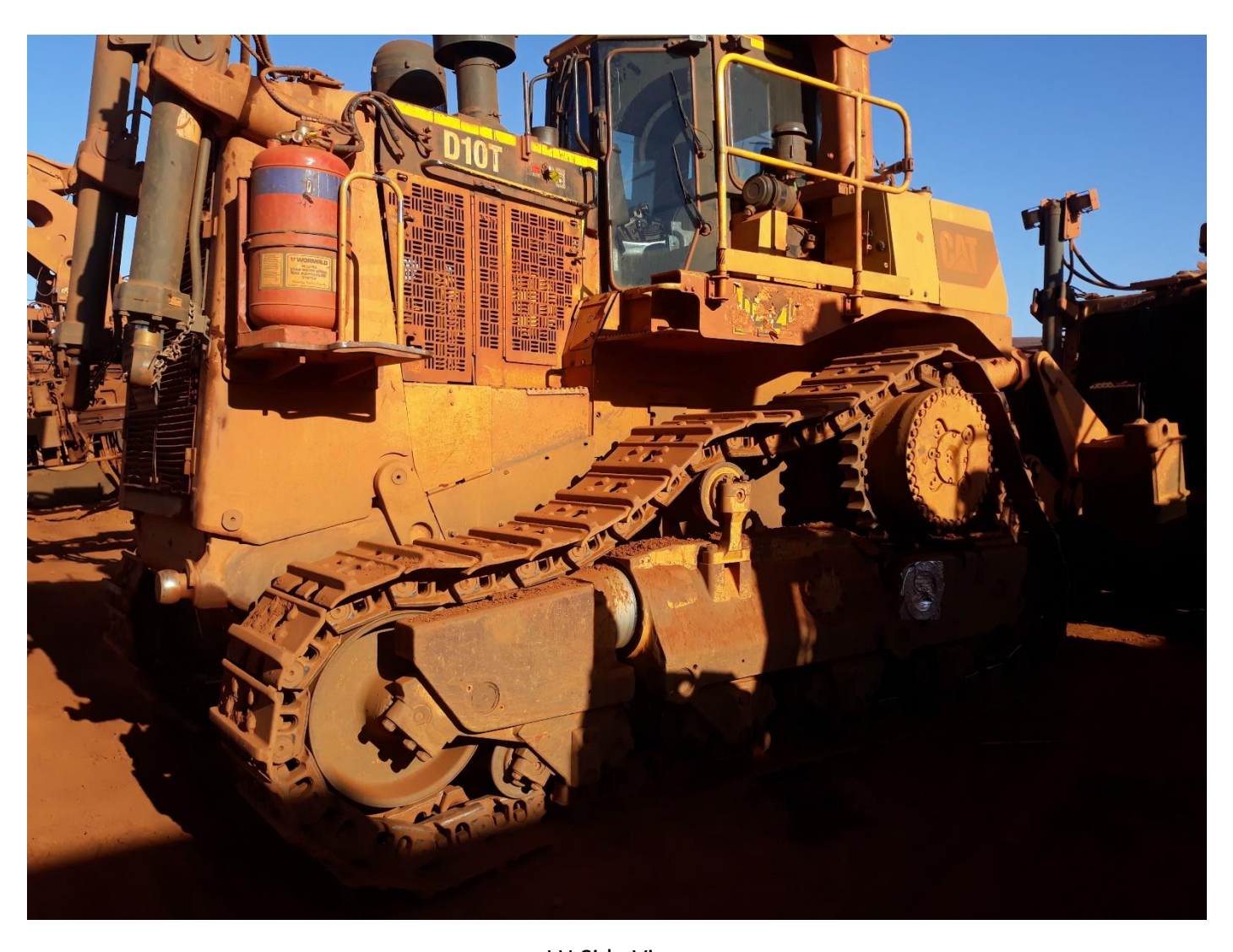
LH Side View