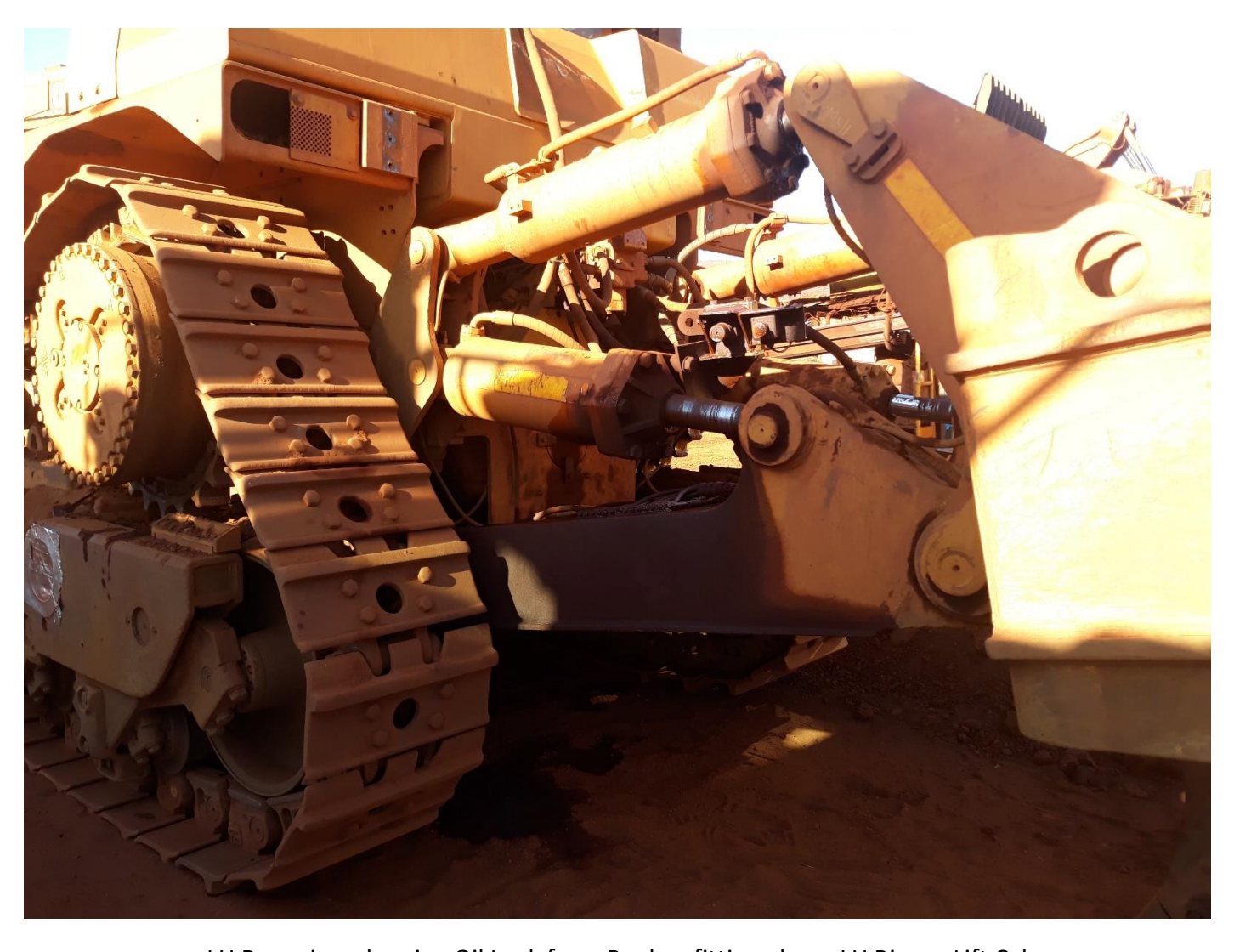
LH Rear view showing Oil Leak from Banlaw fitting above LH Ripper Lift Cyl LH Rear view showing weeping seals LH Ripper Tilt Cyl