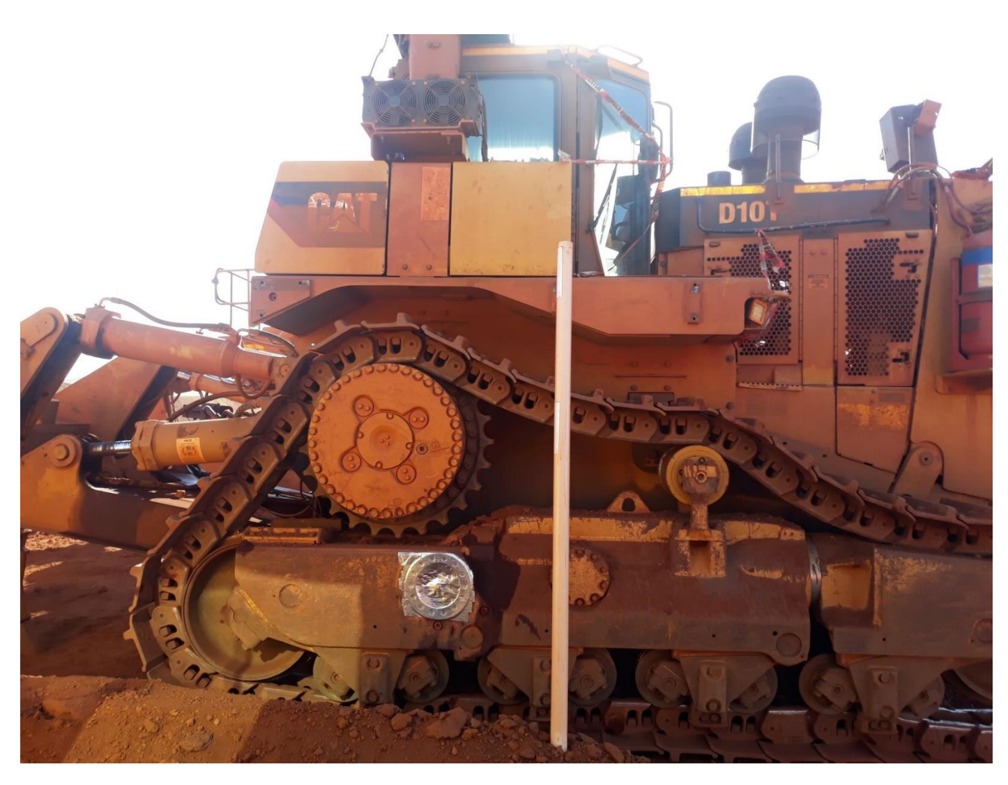
LH Rear Side View