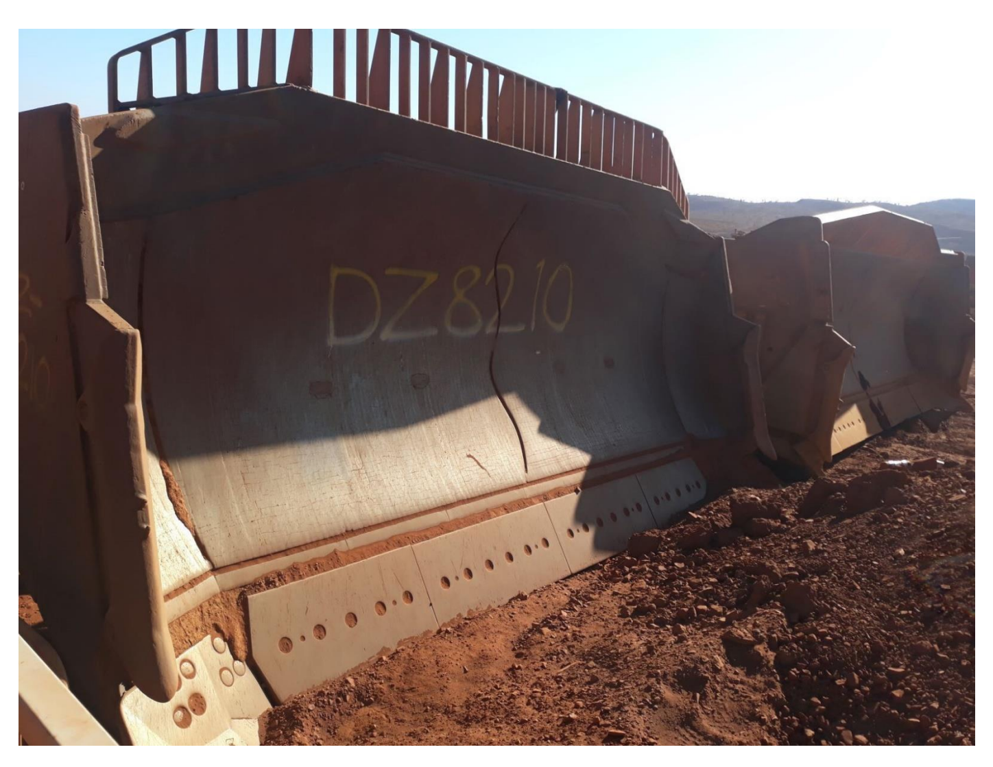
Blade Front View