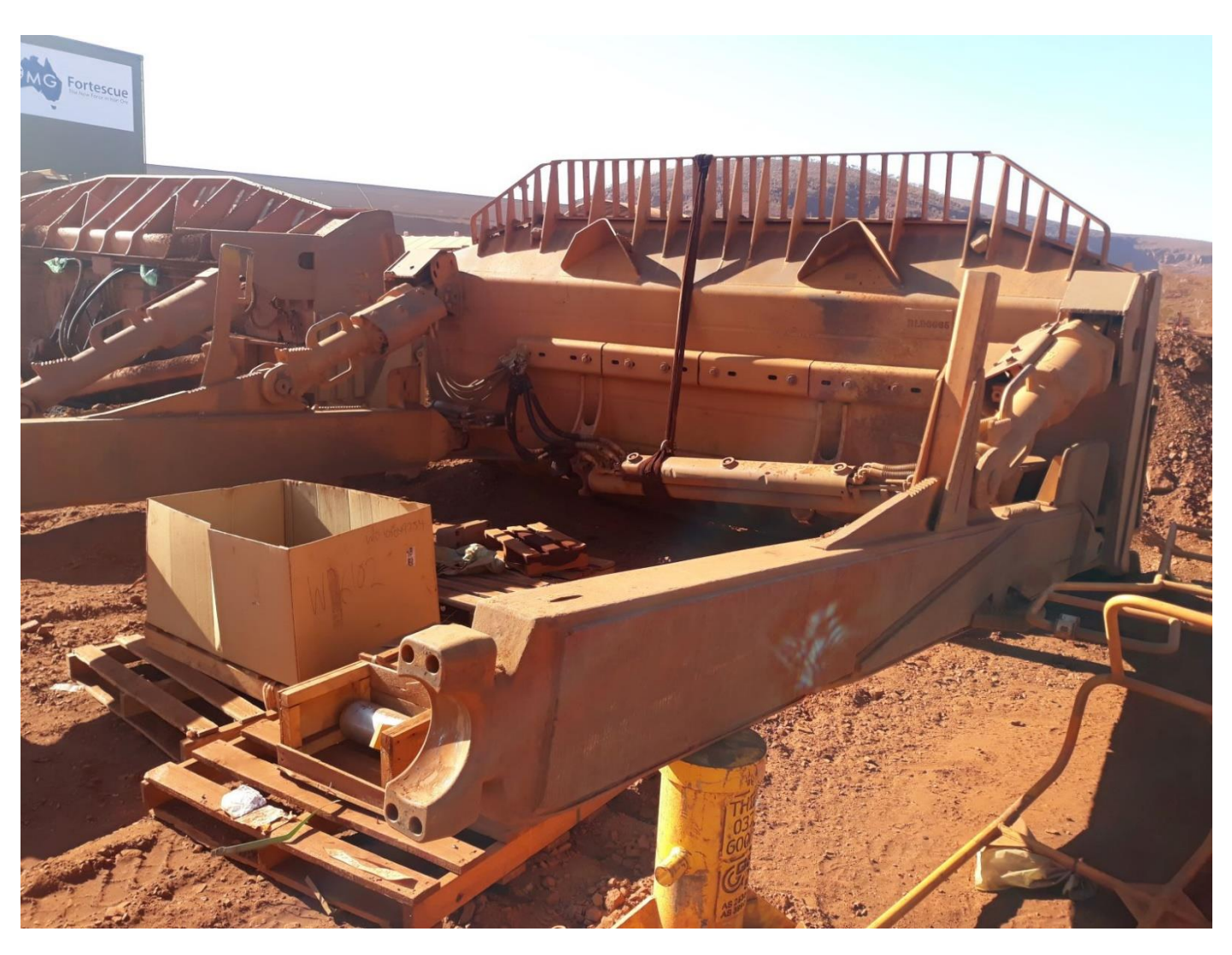
Blade Rear View