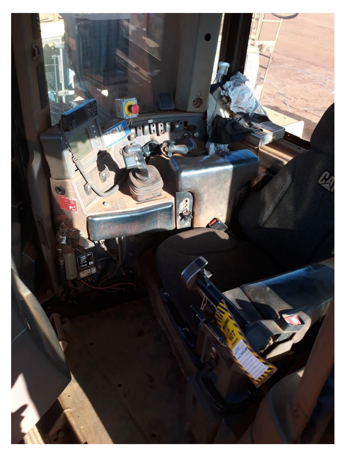
Cab Pic 1