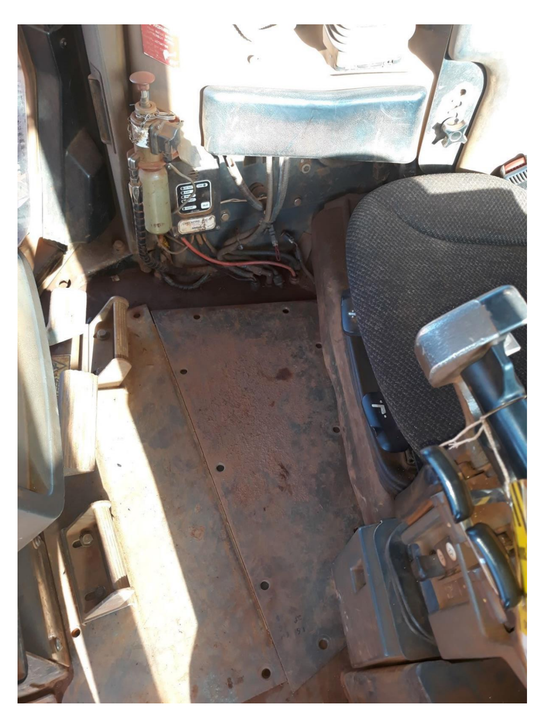
Cab Pic 2