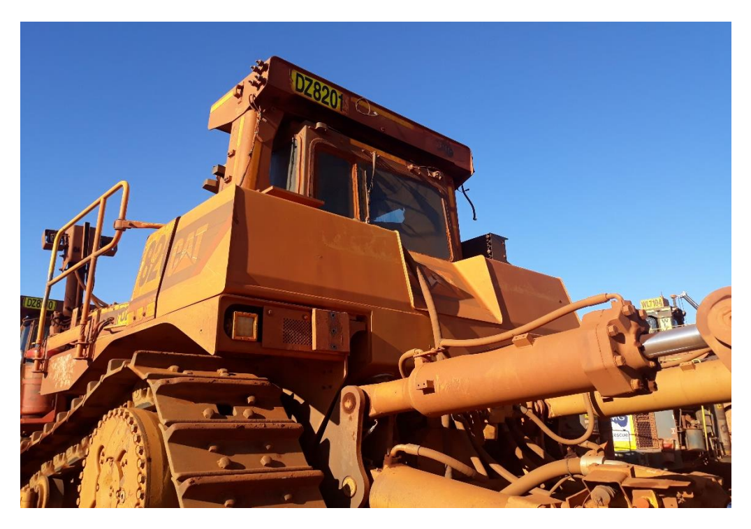
Machine Asset ID