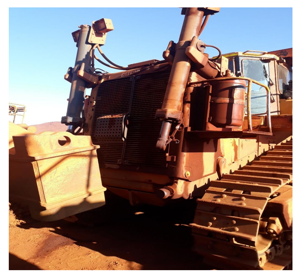
Front View showing 2 x Lift Cyl Leaking

Oil leaking from both Blade Lift Cyl and Blade Trunnion Mount